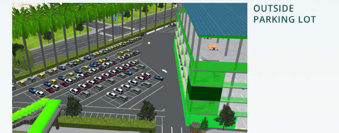
OUTSIDE PARKING LOT

Using smart sensors camera and auto-updated LED marking system to help find space quickly and more convenience at decision point.