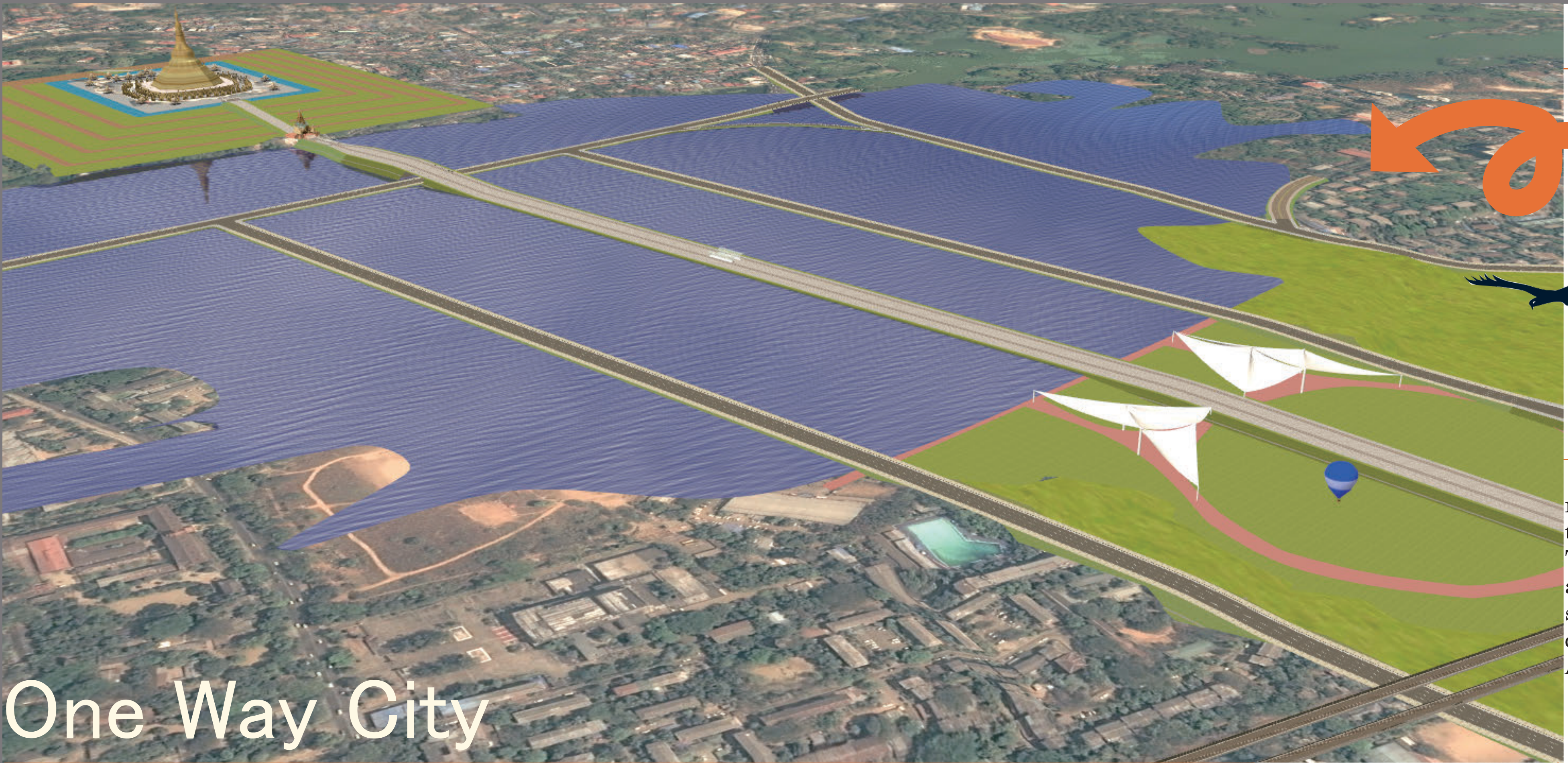
Road line form